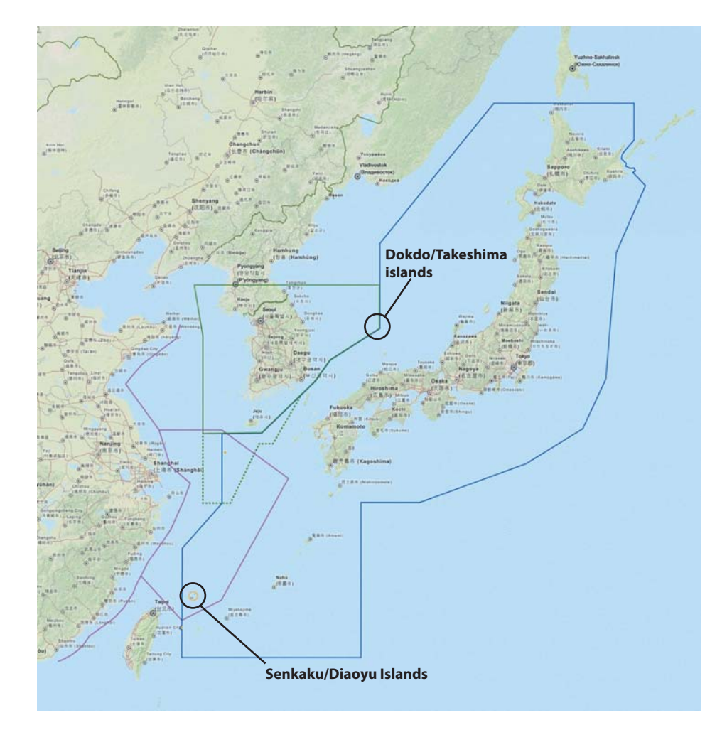
Figure 2: Overlapping Air Defence Identification Zones in the East China Sea, and location of disputed islands

China has steadily increased its defence budget in the past decade: the average annual increase between 2001 and 2011 was 15.6 per cent, though this should fall slightly (according to official figures) to 12.2 per cent in 2014. China now has the second-largest defence budget in the world. The Chinese air force is developing sophisticated stealth fighter aircraft and the Chinese navy is building new submarines, frigates, missiles and even aircraft carriers. This indicates a greater willingness to deploy military power in its neighbourhood (or beyond). US strategists are concerned that China could try to keep US naval forces at a distance, challenging the naval supremacy the US has enjoyed in the western Pacific region for seven decades.